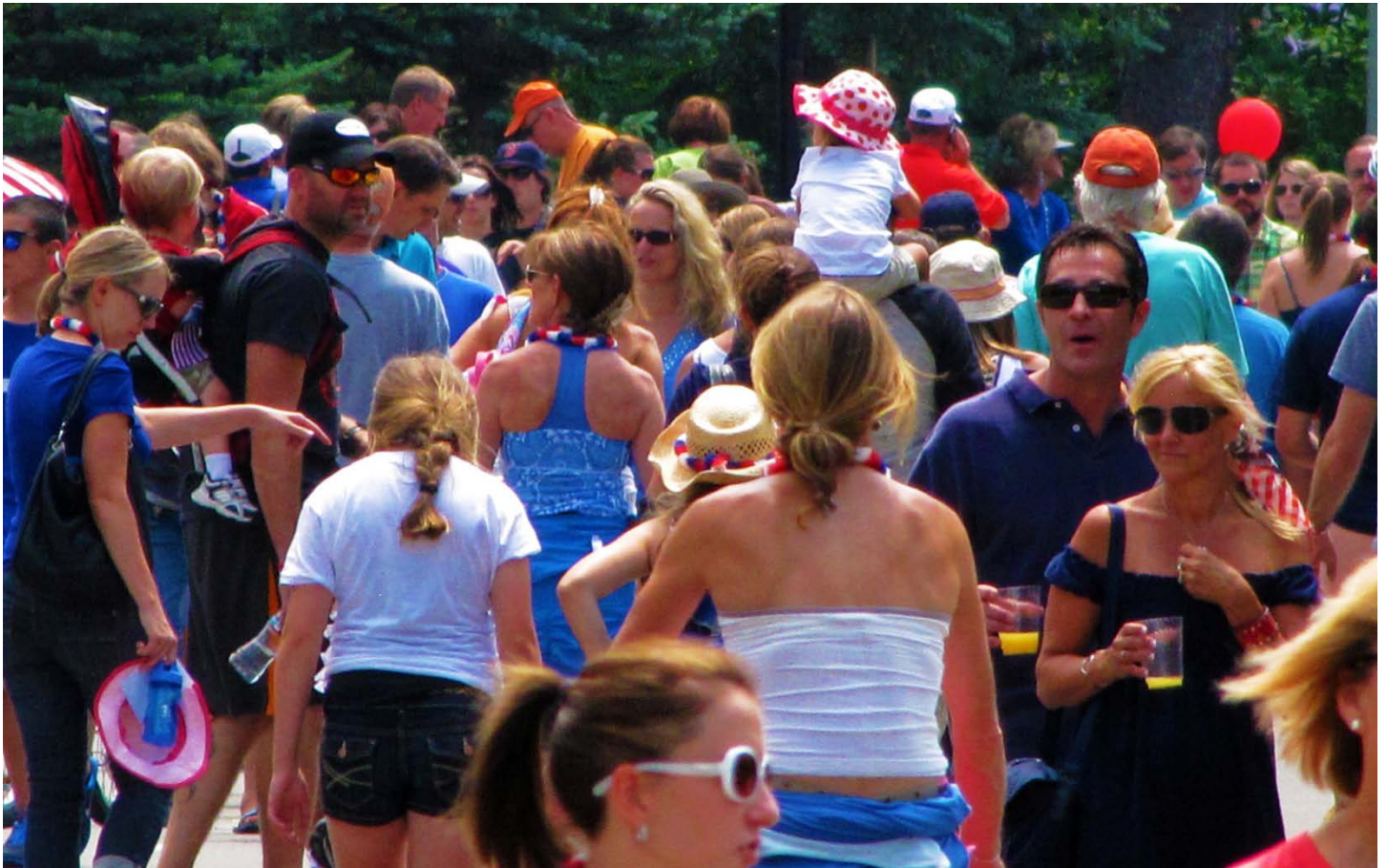
Vail's 4th of July Crowd; what KAABOO proposes for an entire long weekend every year.

Without question such an event would benefit the Vail business community and Vail Resorts. It would also indirectly benefit the community at large through sales tax increases, but only if that additional revenue was used to fund projects for the greater good and not just recycled to promote more events. Having 15,000 people descend on Vail next summer, rising to 30,000+ people in the future, can have negative aspects. Amplified sound would impact at least east Vail neighborhoods; congestion would be pushed to the maximum; parking will be unavailable for many, including residents; road closures could be necessary in the Ford Park area; there could be serious impacts on Gore Creek where it flows through Ford Park, and if past large-crowd events are any clue, disruptive behavior could occur.