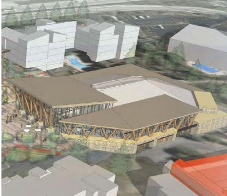
Dobson Arena Remodel is Option 3 in the 2019 Civic Area Master Plan.

The proposal to be considered Tuesday night is in response to a request for proposal that had been issued in November. According to the Town, it received 8 proposals and narrowed the presenters down to Populous. It is the intent of the Town to have Populous provide a conceptual design, schematic design, design development, entitlement and ultimately construction documents. This is part of the Civic Area plan that was adopted in 2019.