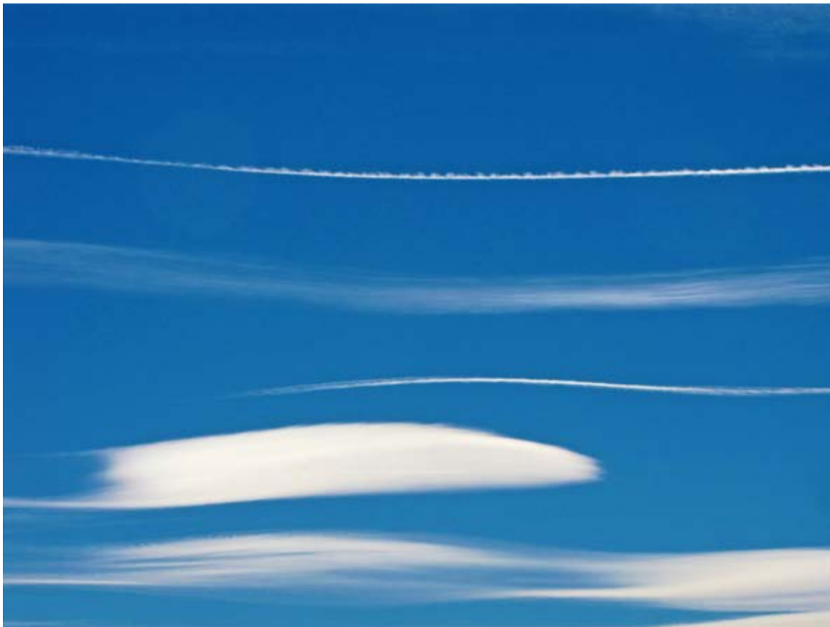
Jet contrails and clouds wisp overhead in a Vail winter sky.