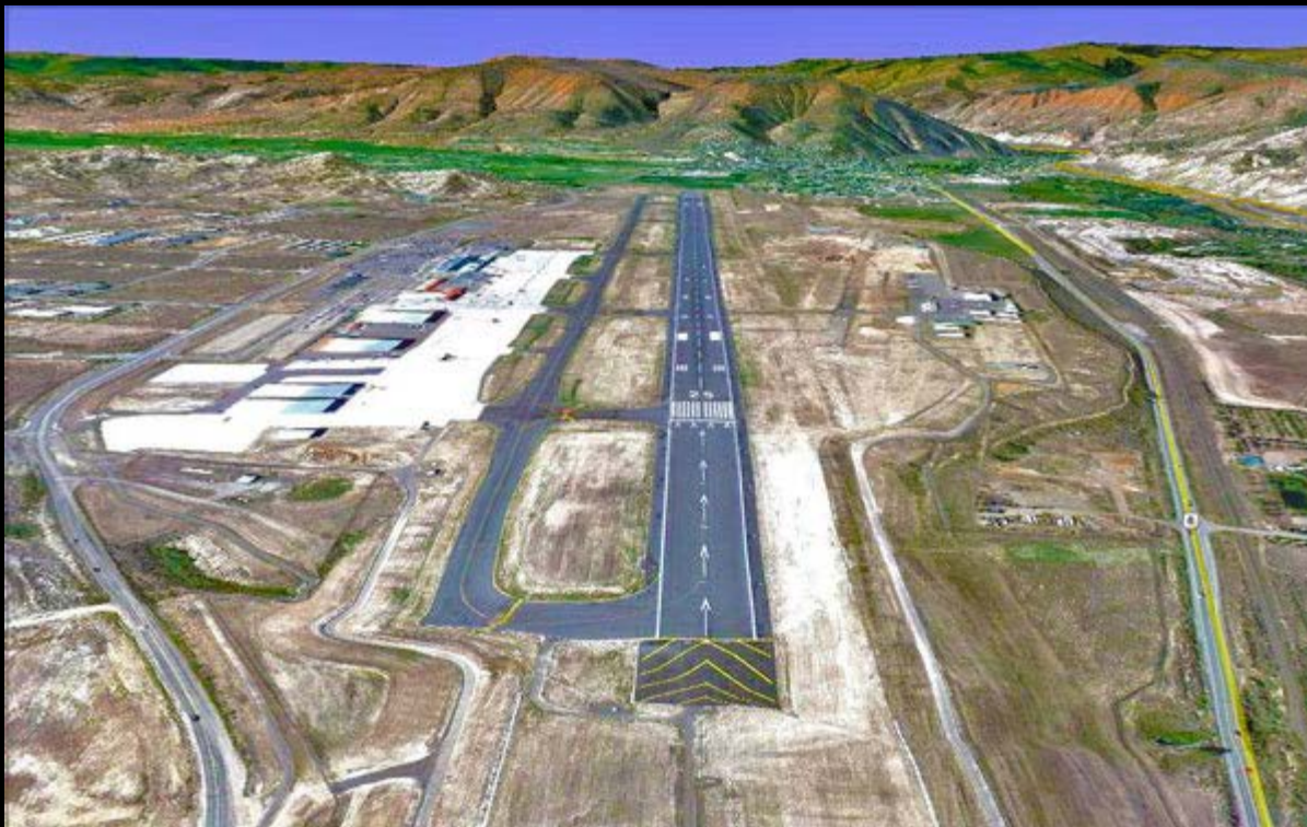
Google eye view of Eagle County Airport, ranked as the 176th busiest commercial airport in the country